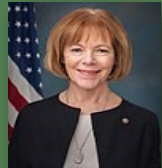
Sen. Tina Smith