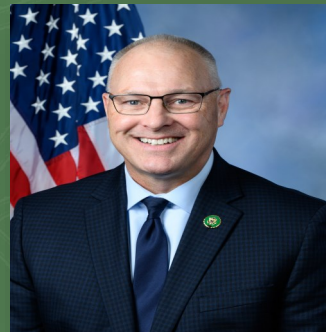
Rep. Pete Stauber