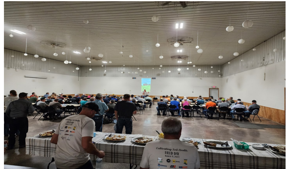
Morrison Soil & Water Conservation Soil Health Day

The MHB provided funding to the Morrison SWCD to facilitate conversations to promote and support soil health.