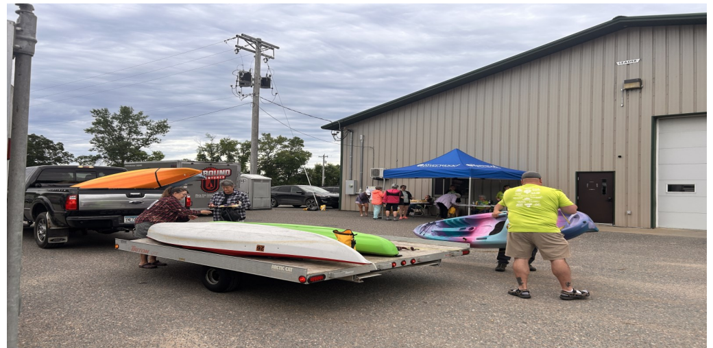
Loading of kayaks onto trailer for transport to launching site.

This model was replicated in multiple MHB counties and generated $ in the 2023 to 2025 season.