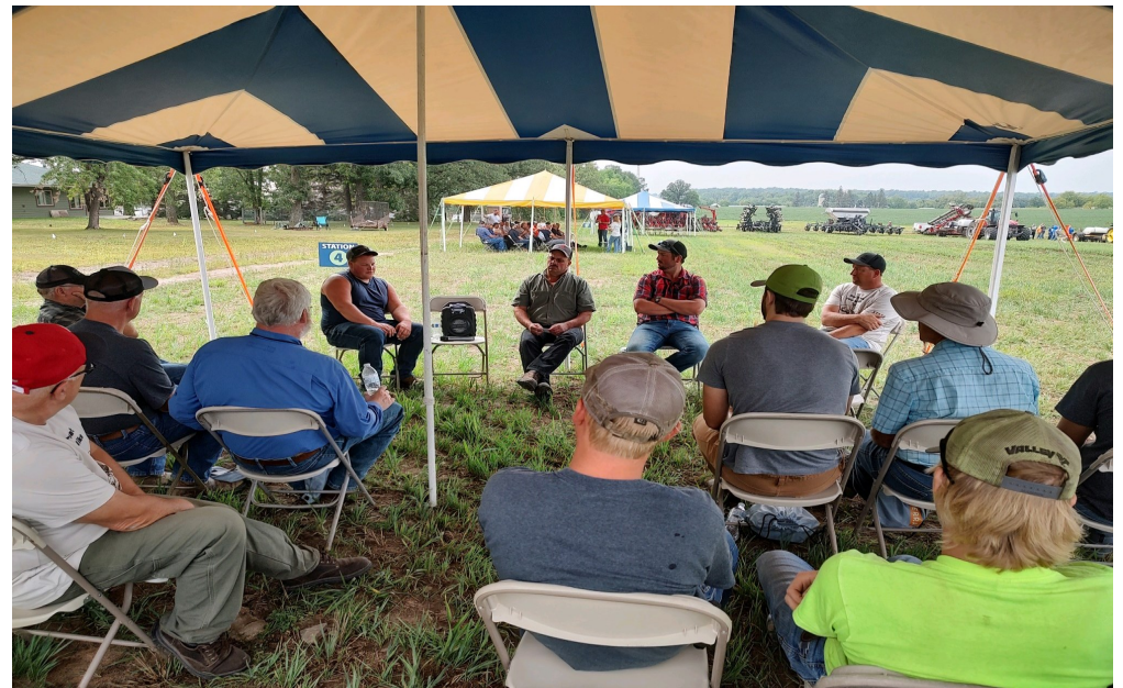
Farmer's networking and discussing options to improve soil health