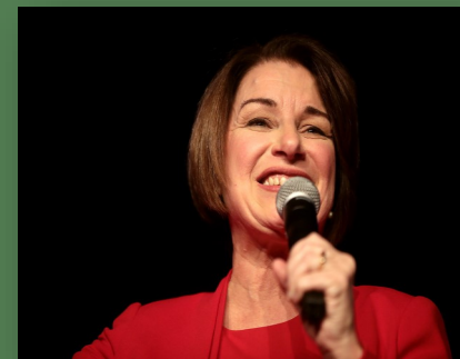
Sen. Amy Klobuchar