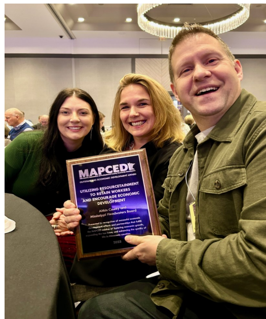
MHB & Aitkin County receiving MAPCED Award for Economic Development at Assoc. of MN Counties Annual Conference.