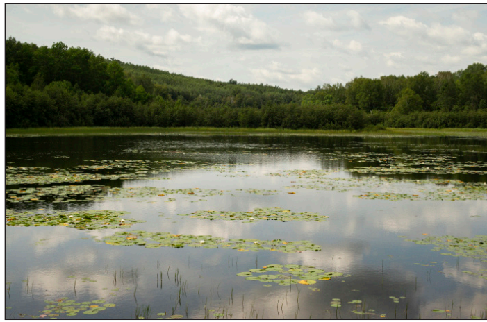
The Trust for Public Land is in the process of acquiring and protecting what is known as the Sheep Ranch property — 2,500 acres in Hubbard County that would expand the boundaries of the Paul Bunyan State Forest. The property contains several lakes and rolling hills. Its protection would connect several other public lands, providing critical wildlife corridors, and providing public recreational opportunities including hunting, fishing, hiking and wildlife observation.

The Vogels planted trees and used previous RIM funding to establish a native prairie to provide habitat and food for monarchs and other pollinators. The property also has an oak forest that has not been logged in living memory, and a small cabin built in 1940. Vogel estimates the property includes about 1 mile of riverfront, given the